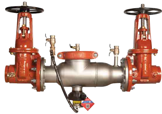
994-0SY with Flood Sensor